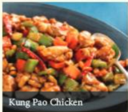
Kung Pao Chicken