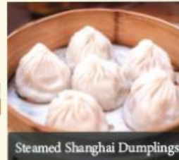
Steamed Shanghai Dumplings