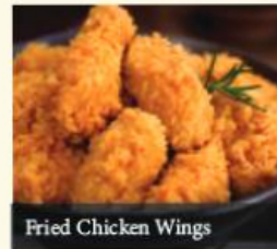
Fried Chicken Wings