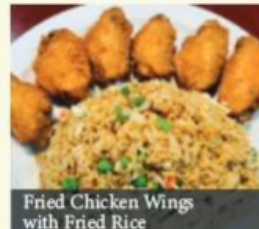
Fried Chicken Wings with Fried Rice