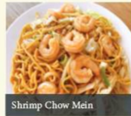
Shrimp Chow Mein