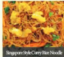
Singapore Style Curry Rice Noodle