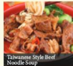
Taiwanese Style Beef Noodle Soup