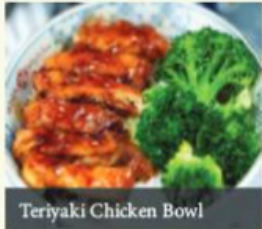
Teriyaki Chicken Bowl