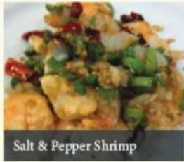
Salt & Pepper Shrimp