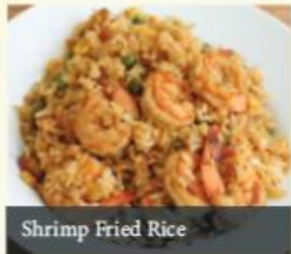
Shrimp Fried Rice